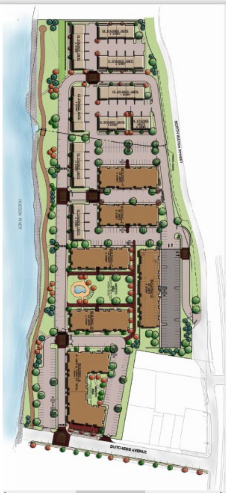
Docket No. 18-0242, Exhibit No. C-4, Page 1 of 1