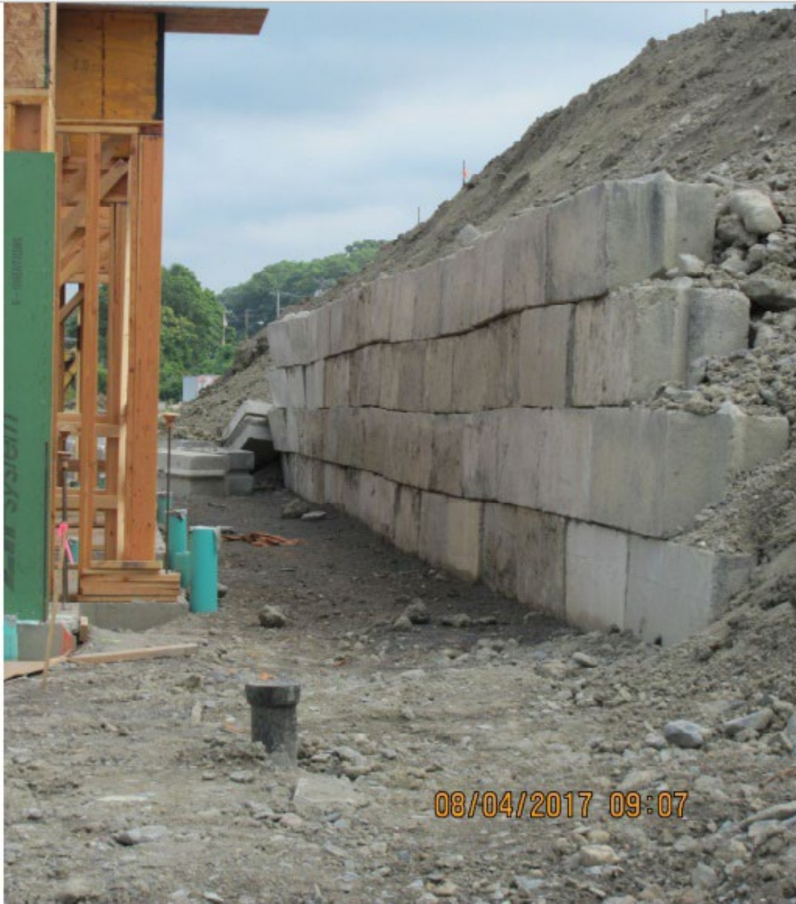
Docket No. 18-0242, Exhibit No. C-21, Page 1 of 1